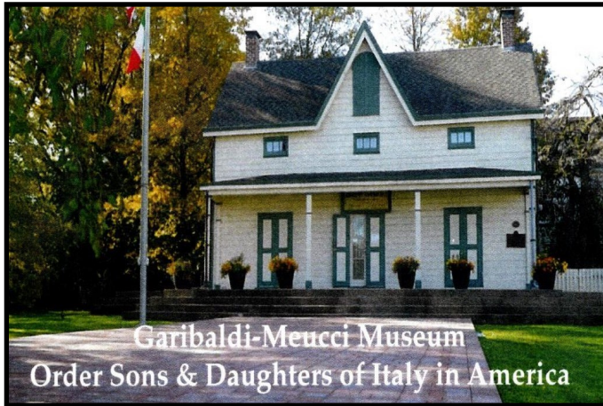
Garibaldi-Meucci Museum Order Sons & Daughters of Italy in America

Order Sons & Daughters of Italy in America Grand Lodge of California